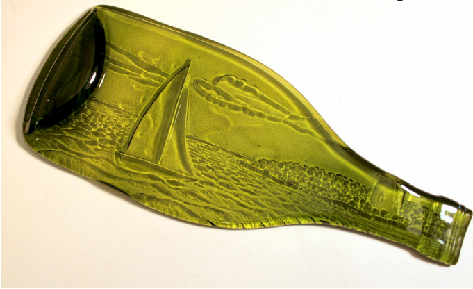
750 ml wine bottle fired on DT26 Sailing Texture