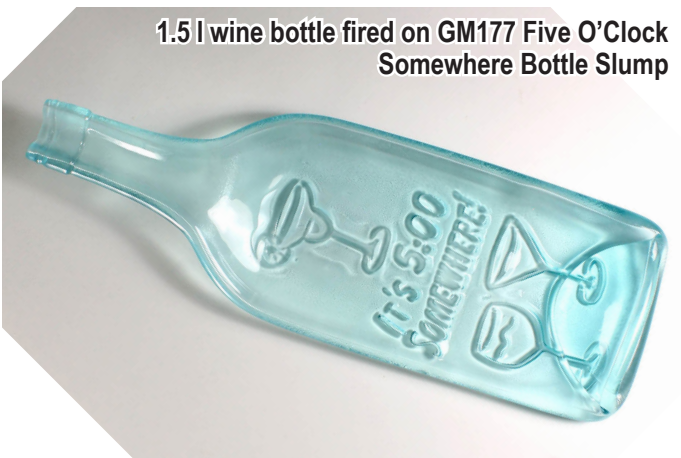
1.5 l wine bottle fired on GM177 Five O'Clock Somewhere Bottle Slump