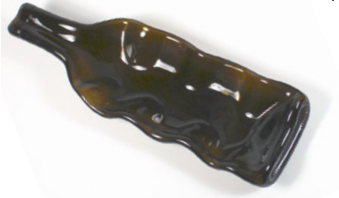
750 ml wine bottle fired on GM190 Fluted Bottle Slump