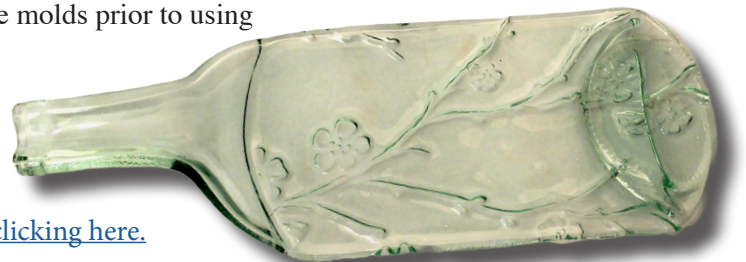
750 ml wine bottle fired on GM161 Neck Only Mold resting on DT12 Cherry Branch Texture