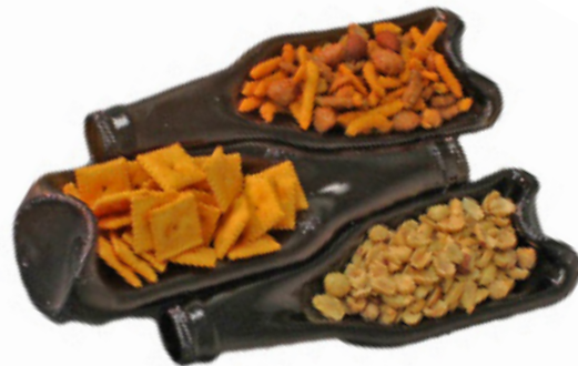
Three 12 ounce beer bottles fused together and slumped in GM99 Three Bottle Slump